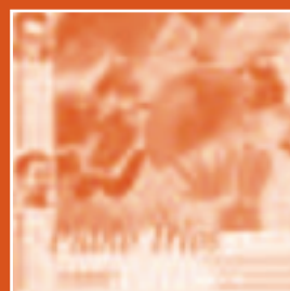
Dmitry Sitkovetsky Piano Trios by Shostakovich Vainburg and Veprik