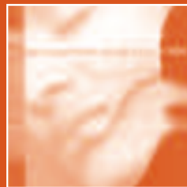
Anoushka Shankar "Rise"