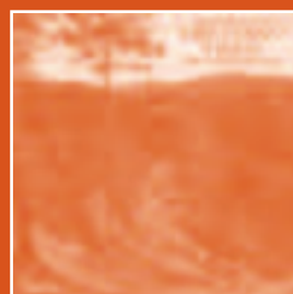
Florestan Trio Mendelssohn Piano Trios