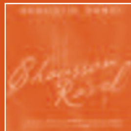
Jean-Philippe Collard Chausson Concert